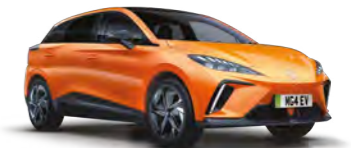
VOLCANO ORANGE PREMIUM**