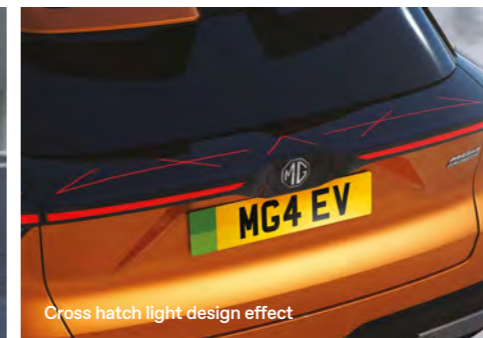
Cross hatch light design effect