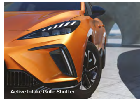
Active Intake Grille Shutter