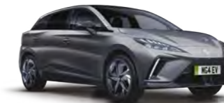
CAMDEN GREY METALLIC*