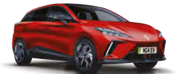
DYNAMIC RED TRI-COAT*

*Metallic, tri-coat and premium paint optional at extra cost. **Trophy Long Range only.