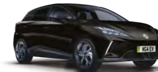
BLACK PEARL METALLIC*