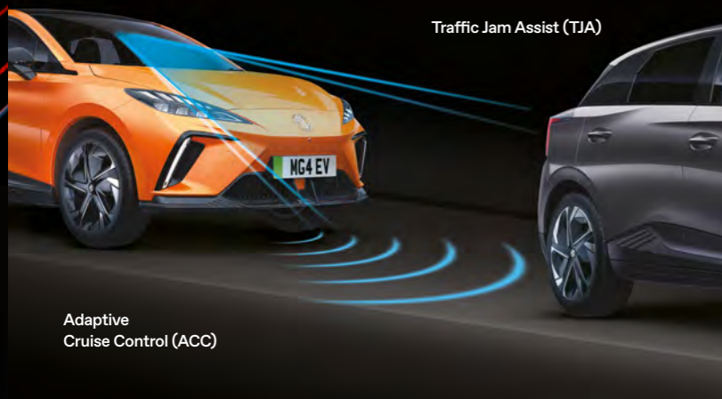
Traffic Jam Assist (TJA)

The MG Pilot suite of high-tech driver assistance technology gives you added confidence on the road. A selection of warning and alert features assists the driver, maintaining safety and simplifying everyday driving.